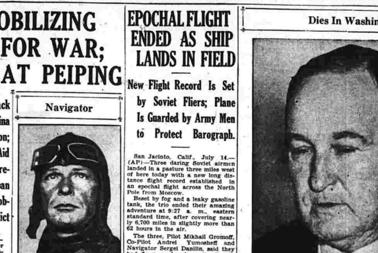
SENATOR JOSEPH TAYLOR ROBINSON

House of Commons Told Boat Seized Trying to Enter Santander Port; Loyds Have No Report.